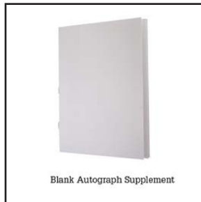
Blank Autograph Supplement